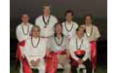
Figure 3 Combined Meeting in Jeju, Korea (2008)