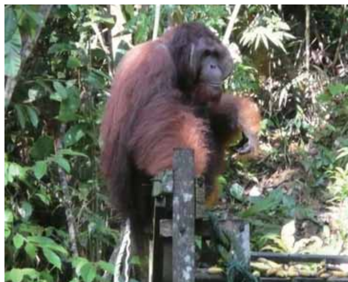
Surgeon Getting Back to Their Roots! - A Male Orang Utan in Borneo