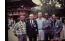
Figure 2a APOA team leaders with POSNA president in Hawaii (2010)